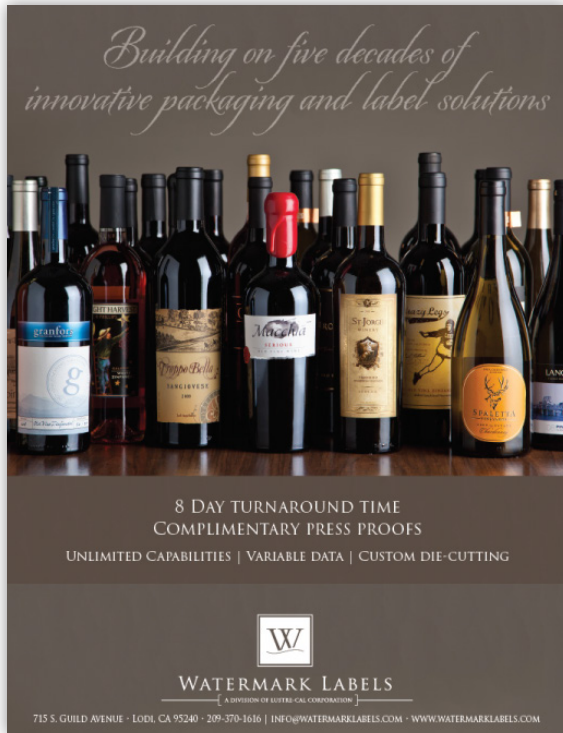
Back Cover, Inside Covers & Full Pages w/ Bleed: 8.75" x 11.25" Trim size: 7.75" x 10.25" Safe Area: 7.25" x 9.75"