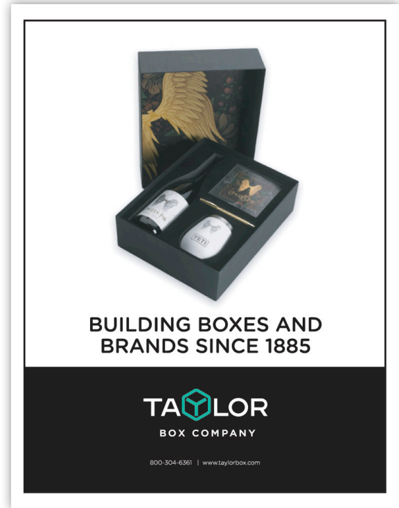
Full Page no Bleed 7.25" x 9.75"