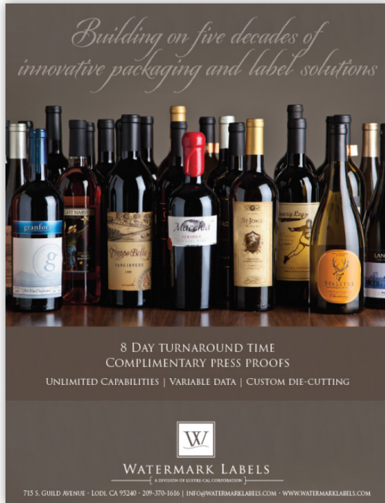
Back Cover, Inside Covers & Full Pages w/ Bleed: 8.75" x 11.25" Trim size: 7.75" x 10.25" Safe Area: 7.25" x 9.75"